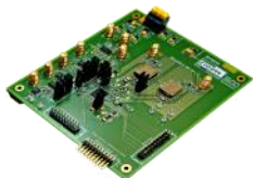
EV9830 Digital Radio AFE Processor