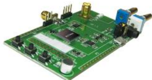
DE9941 Linear Modulation Radio