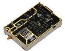
VDES1000 Maritime VDES Solution