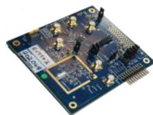
EV9942 Direct Conversion Receiver