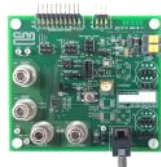
EV6550D Ultra-low Power Codec