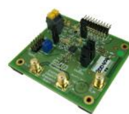
EV9730 RF Quadrature Modulator/Demodulator