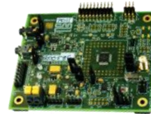
PE0101-7011 Digital Voice Encryption