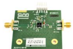
EV9011 RF Power Amplifier