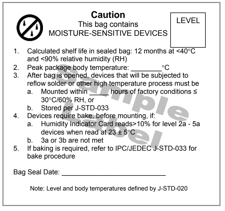
Fig 2. The Moisture-Sensitive Caution Label